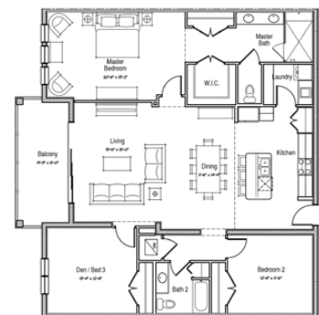
Unit C - 1805 sq. ft.