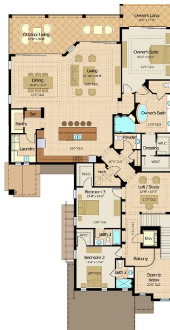
Unit B – Upper Floor