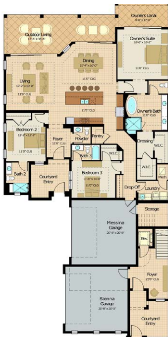
Unit A – Main Floor