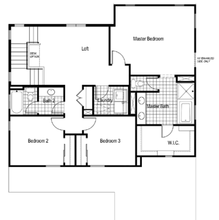
Plan 1 – Upper Floor