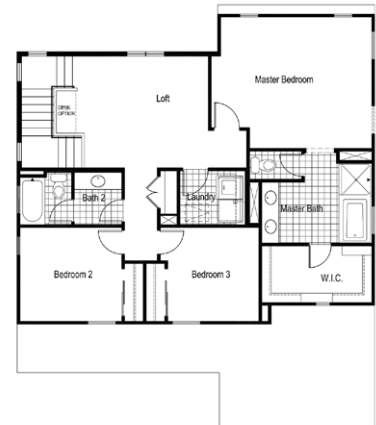
PLAN 1 – UPPER FLOOR