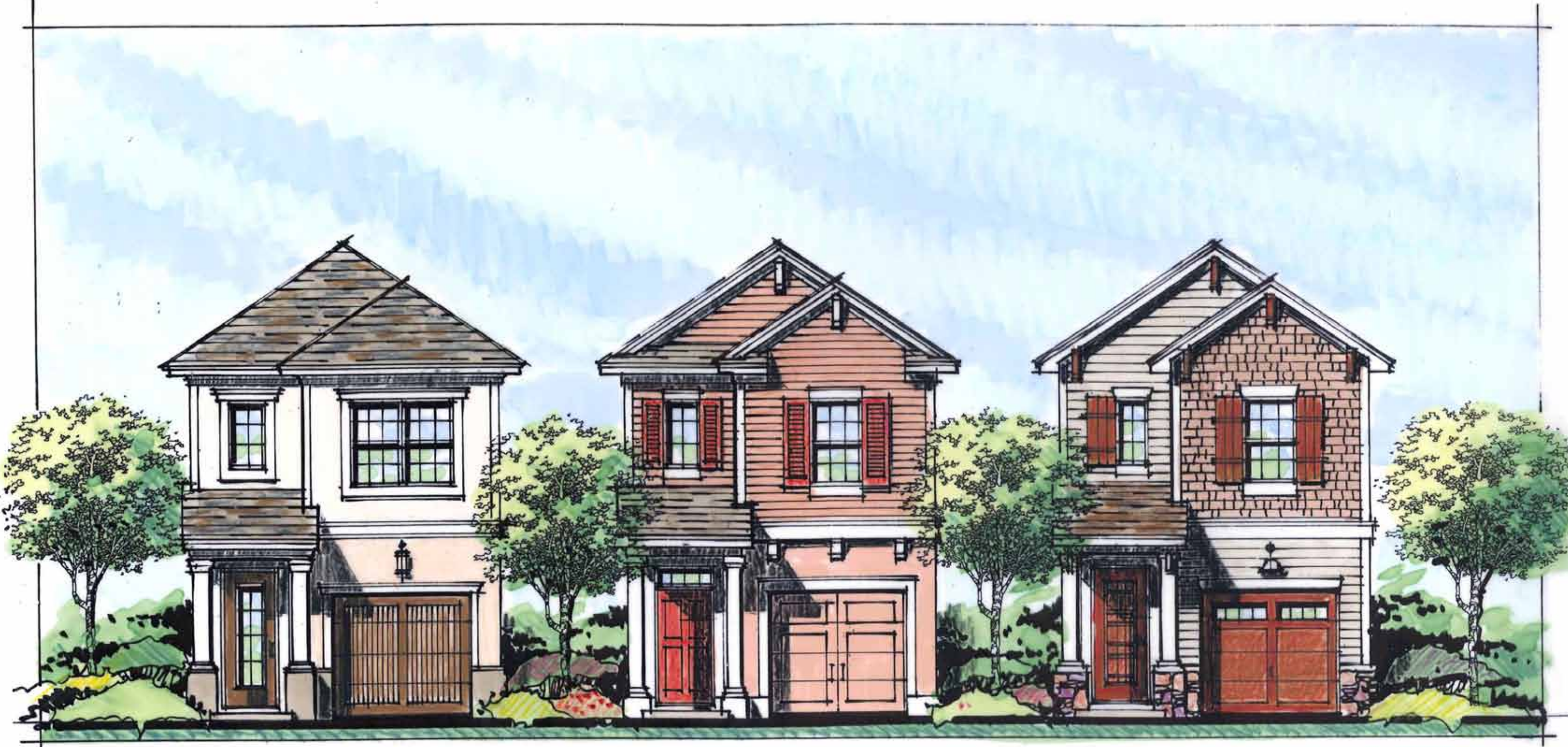
single family elevations