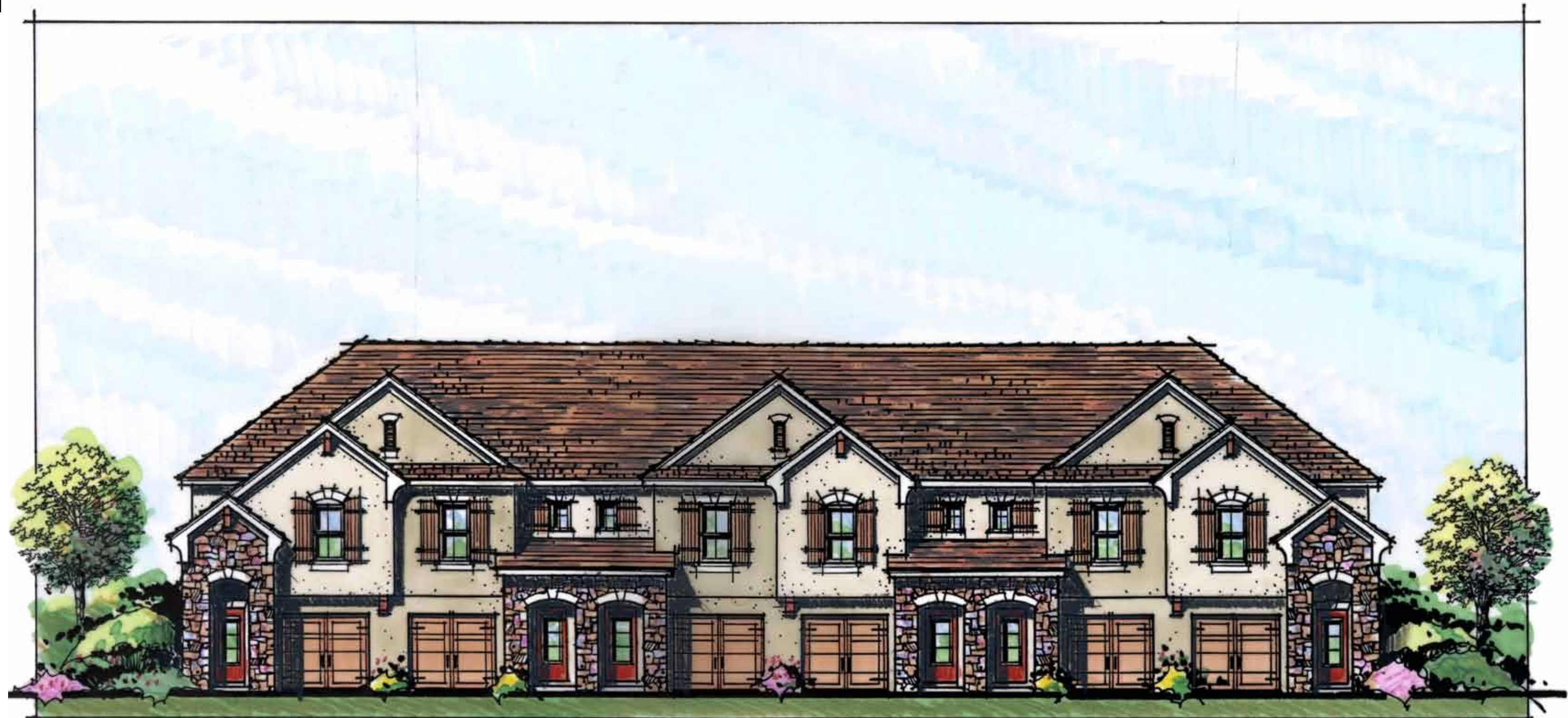
traditional rowhouse elevation